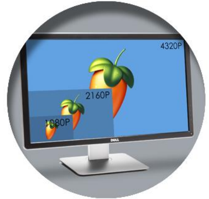
4K, 5K & 8K Monitors

FL Studio 12 introduces the biggest change to the user interface in over 10 years. High resolution video monitors are here to stay with 4K (3840x2160, 4096x2160) and 5K (5120x2880) models now flooding the market at ever lower prices. FL Studio can take full advantage of these resolutions with a pin-sharp user scalable UI. FL Studio's user selectable scaling factor ranges from 100% to 400%, so it's ready to take full advantage of even 8K (7680x4320, 8192x5120), with 16X the pixels of a 1080p monitor.